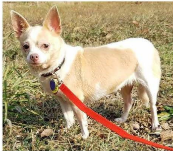
(a) Taking a break while on a walk