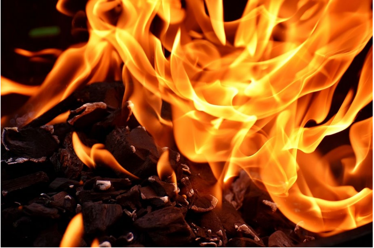
Figure 1. This is a photograph of a fire.