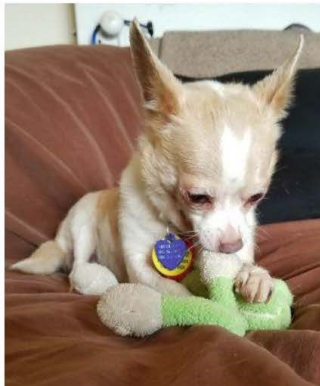
(b) Chewing on a toy